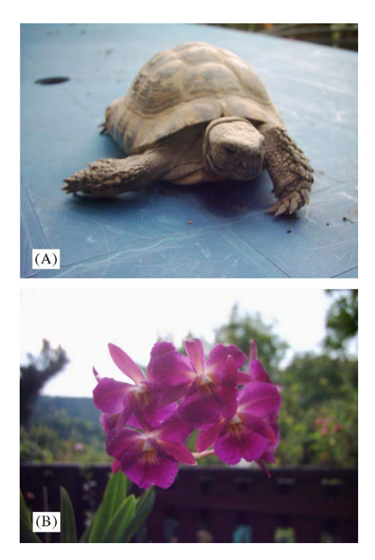
Fig. 2. Putative descendants of hopeful monsters. (A) Turtles ( Testudo hermannii ) and (B) flowering plants (inflorescence of an orchid species) are prime candidates for owing their body plans to saltational evolution via hopeful monsters rather than the gradual evolution envisaged by the Synthetic Theory.

Moreover, in contrast to the situation in other vertebrate species in which the scapula develops outside the rib cage, the shoulder girdle is found inside the rib cage in turtles (Rieppel, 2001). For such a situation a plausible scenario of continuous change from any kind of possible ancestor cannot be constructed (Rieppel, 2001). In line with this, turtles appear abruptly in the fossil record of the late Triassic, with no intermediate changes so far being found (reviewed by Ohya et al., 2005). Even though this does not completely rule out that many intermediate forms once existed, it at least suggests that the turtle body plan originated quickly, especially since one cannot say that turtle bones have a low potential to fossilize (a serious problem in other cases of rapid appearance of novelties, e.g. origin of flowers, see below). There is meanwhile evidence that the turtle body plan originated due to changes in axial-level specific alteration in early development, caused by changes in the expression domain of some Hox genes (Ohya et al., 2005).