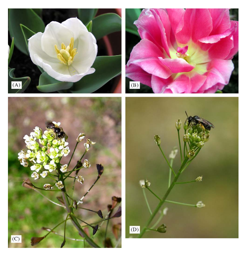
Fig. 1. A putative hopeless (B) and hopeful monster (D). In the upper row, a wild-type flower of tulip ( Tulipa gesneriana , left) is compared to a "double flower" or "filled flower" mutant (right); while the wild-type flower has male (stamens) and female reproductive organs (carpels) in the centre, the filled flower is sterile, because all reproductive organs are transformed into showy yet sterile perianth organs, thus hampering sexual reproduction and undermining fitness. The lower part shows inflorescences of Shepherd's purse ( Capsella bursa-pastoris ). While wild-type flowers have four different types of floral organs including petals (the white organs in C), all petals are transformed into stamens in the "decandric" variety shown in D, which hence has 10 stamens and 2 carpels in all of its flowers and is fully fertile. Note that while evolutionary biology usually favours animal model systems (an attitude known as zoocentrism), the insects shown here are only decorative elements. (Pictures courtesy of Hannelore Simon (upper row) and Janine Ziermann (lower row)).